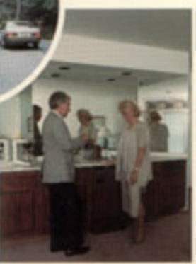
Spacious rooms in the Chetola Lodge provide guests with High Country comfort.

Guests will find comfort and convenience to the surrounding area while staying at the Chetola Lodge & Conference Center with its spacious rooms and suites. In rooms overlooking Chetola Lake and the bordering woods, the balcony becomes a favorite spot to relax after a day of mountain adventure.