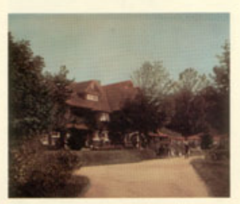
Near the turn of the century Chetola served as a number resort for wealthy visitors from the "flat lands."

standard of excellence marks the tradition of Chetola, a mountain resort tucked away among the rolling hills, tranquil streams, and natural woodlands of Western North Carolina. For over a century the cultivated tastefulness of Chetola has provided owners and guests a retreat from the rush of the everyday world.