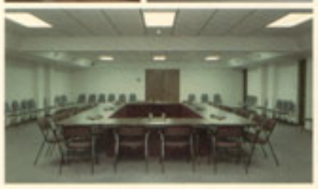
The Chesola Lodge features handsome, well-equipped meeting rooms.

Chetola specializes in hosting small and medium-sized conferences. Participants will enjoy the comfortable accommodations as well as the many amenities of Chetola Resort. Convenient to the neighboring communities, the Chetola Lodge & Conference Center affords both privacy and accessibility.